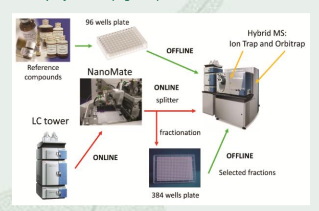
Figure 1: Schematic overview of MS<sup>n</sup> spectral tree data generation.

High mass resolution MS<sup>n</sup> fragmentation data was obtained by using a LC-PDA-LTQ MS-Orbitrap FTMS (Thermo) combined with a Nanomate fraction collector / injector (Advion) with a chip-based nanospray source (Figure 1).